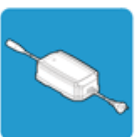
BATTERY CHARGER 8 Amp