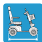
OVERALL LENGTH 1340mm