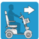
MAXIMUM RANGE Up to 44km