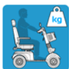
MAXIMUM USER WEIGHT 160kg (on flat ground)