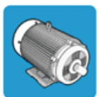
MOTOR 2.0Hp high torque motor (4 Pole)