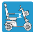
ARMREST HEIGHT (FROM SEAT) 190mm