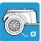
TYRES (PNEUMATIC) Ø356mm - Front + Rear