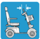
TILLER WIDTH 470mm