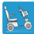
MAXIMUM CLIMB ANGLE 15°