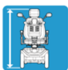
OVERALL HEIGHT 1300mm