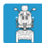
ARMREST WIDTH 60mm