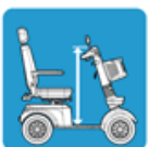
TILLER HEIGHT 930mm