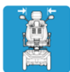
SEAT WIDTH 510mm