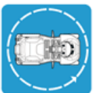
TURNING CIRCLE 1600mm