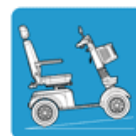
SAFE CLIMB ANGLE 10°