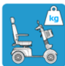
PRODUCT WEIGHT 136kg