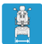
OVERALL WIDTH 740mm