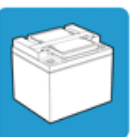
BATTERY 2 x 75Amp minimum (supplied)